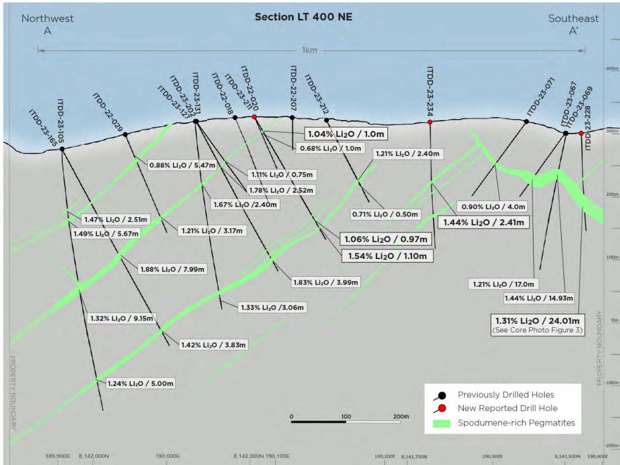
Figure 2. Section LT400 NE Showing New Drill Holes ITDD-23-211, ITDD-23-228 and ITDD-23-234