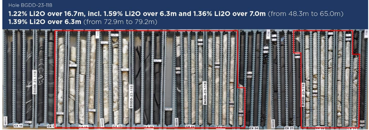
Figure 3. Core Photo, Hole BGDD-23-118