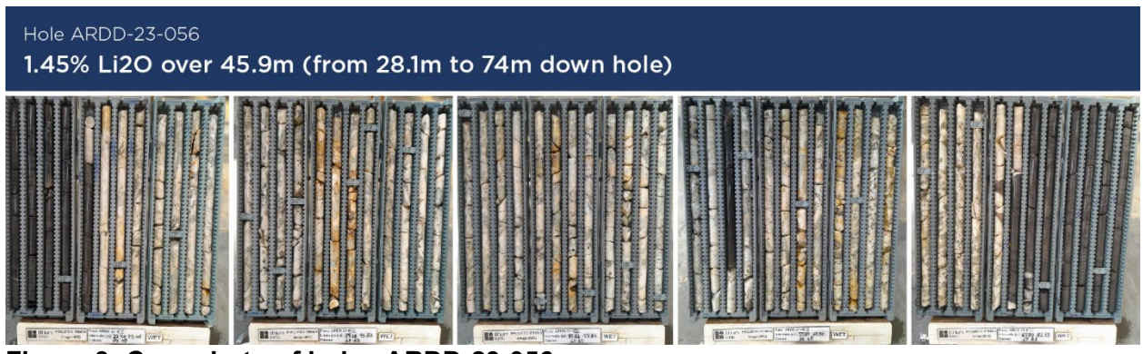
Figure 3: Core photo of holes ARDD-23-056